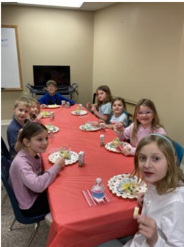
The Junior Choir celebrated Valentine’s Day with a party and donating to Our Little Pantry!